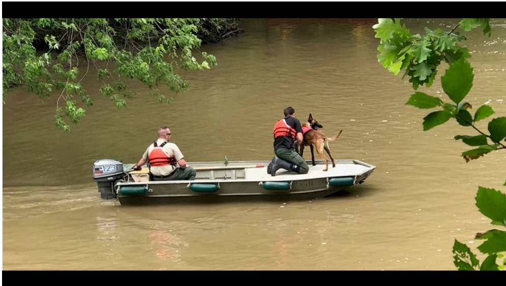
Green Camp drowning investigation and search

The Marion County Sheriff's office says two kayakers drowned in the Scioto River Monday.